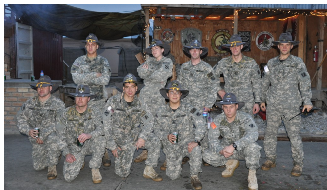
Dustoff in their newly christened Stetsons